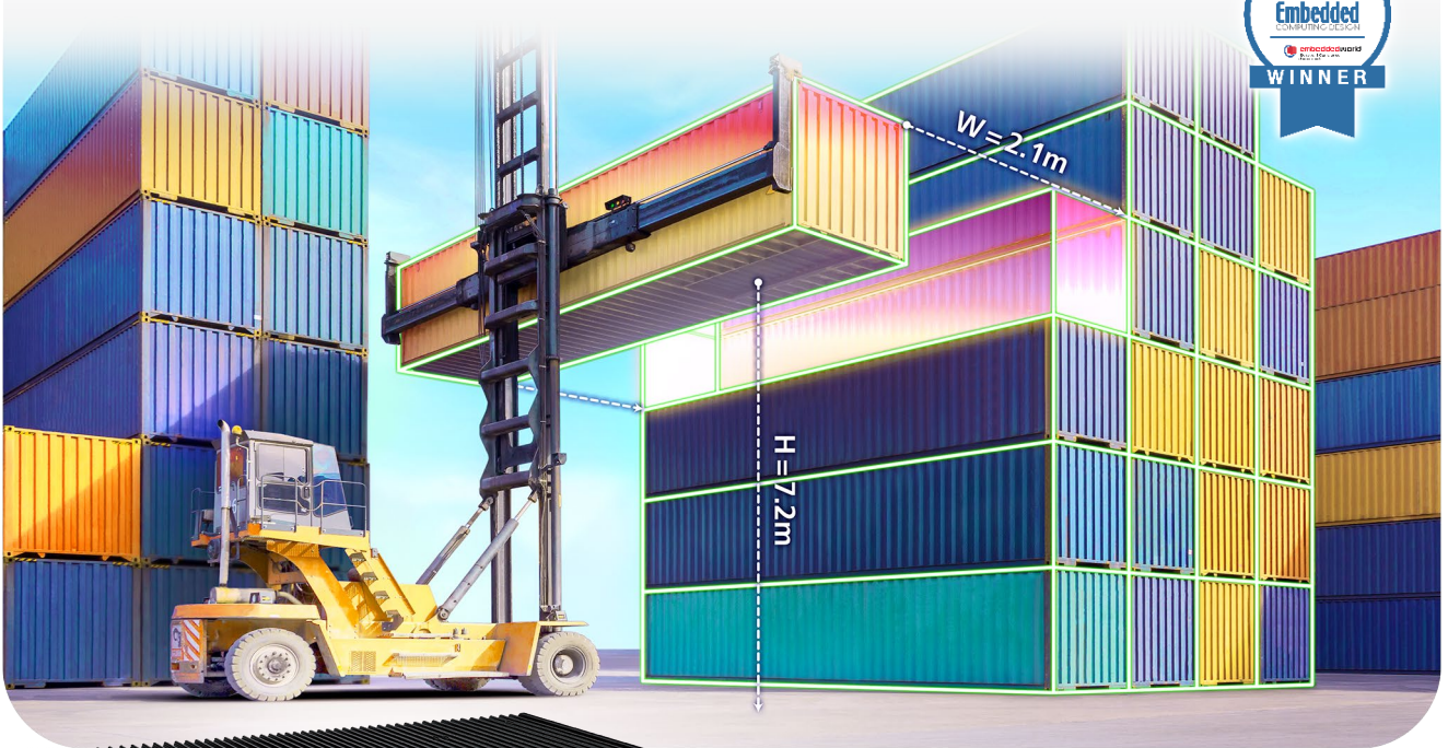
^ AI-powered Cargo