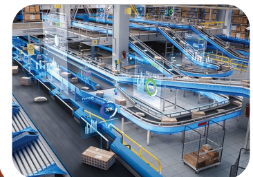
^ Intelligent Logistics